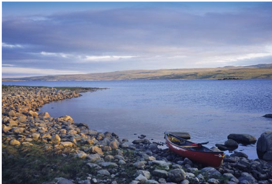
© Loch Shin | Inspirational Coaching

DESCRIPTION There are few features or settlements. A start may be had on Loch a' Ghriama, connected to Loch Shin to the north, and crossed by a bridge at the neck (390 252). The A838 runs down the north-east side. Lairg is a pleasant village, only 11km from Bonar Bridge, with usual facilities. A road down the west side of the River Shin (grade 1-3), leads to the grade 4 Falls of Shin (visitor centre and café at 576 991), well worth visiting in autumn to see the many salmon coming up to spawn, and jumping the falls.