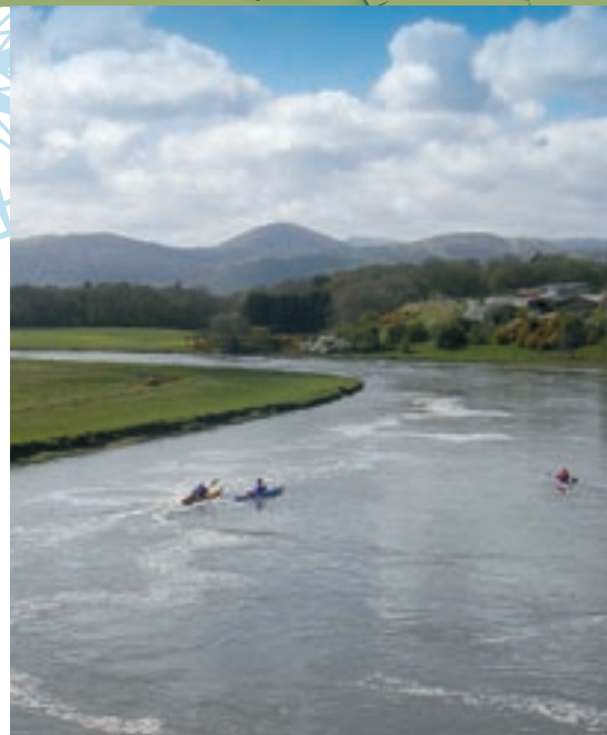
The Conwy by Tal y Cafn and Ty'n-y-groes | Andy Biggs

The old town of Conwy boasts an abundance of shops, pubs and cafés. There is a youth hostel and plenty of camping nearby. One campsite of note is Conwy Touring Park, 3km south of Conwy on the B5106, with its view over the middle part of the estuary, Tel. 01492 592856.